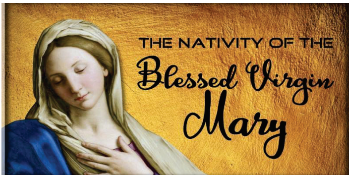
THE NATIVITY OF THE Blessed Virgin Mary

Those who have contacted the office with an interest in becoming catholic and received an email from the RCIA coordinator are reminded to attend the information night on Tuesday, September 9 at 7:00 pm in the parish hall .